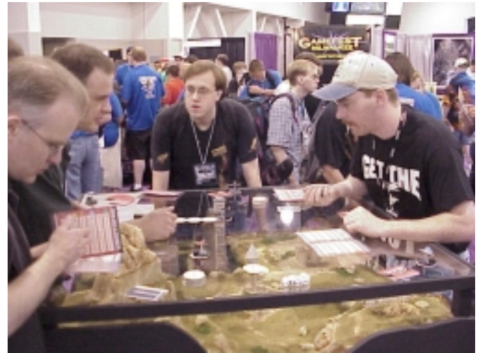
An alpha version of the new Crimson Skies game was demonstrated on this special two-level table.