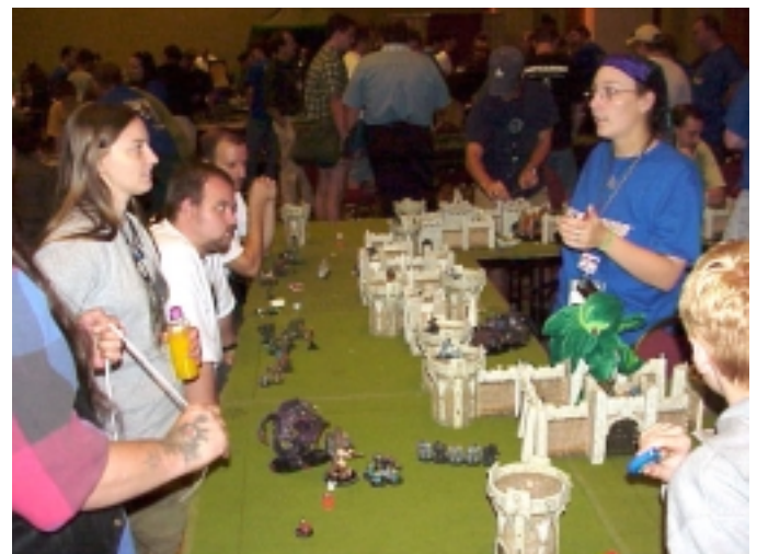
Conquest players got to assault a seriously huge castle on the Conquest table.