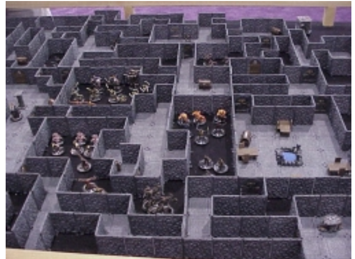
A new line of plastic tiles and components will be available for MK Dungeons —and all you salivating D&D players as well.