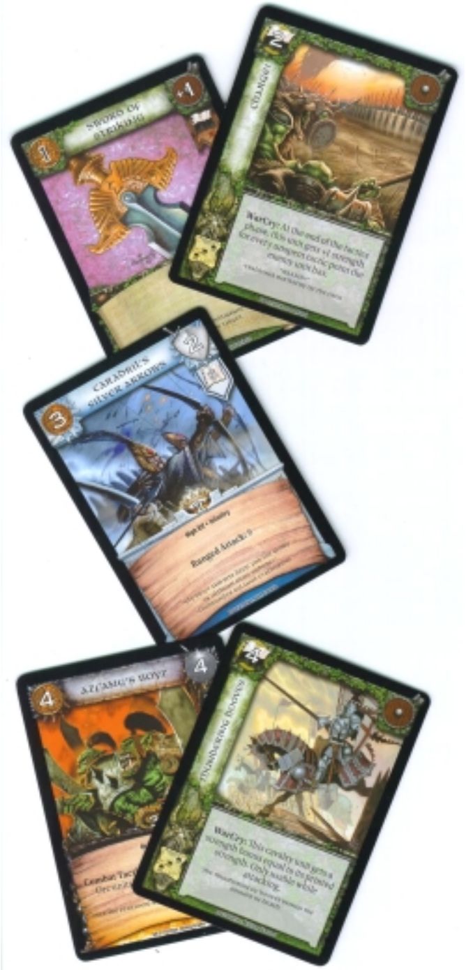
Here are a few of the cards from the sample starter decks for the new War Cry CCG from Sabertooth Games.

There are just two of the juicy new releases from Wizards of the Coast this month!